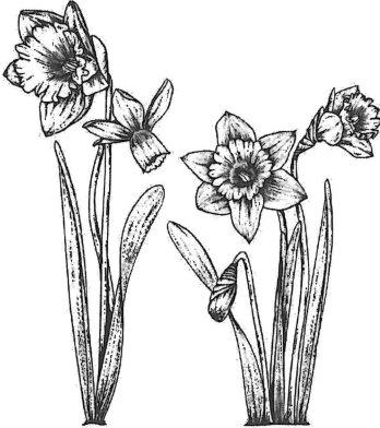
“Your Local Cancer Organization”